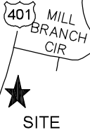
VICINITY MAP ( NOT TO SCALE )