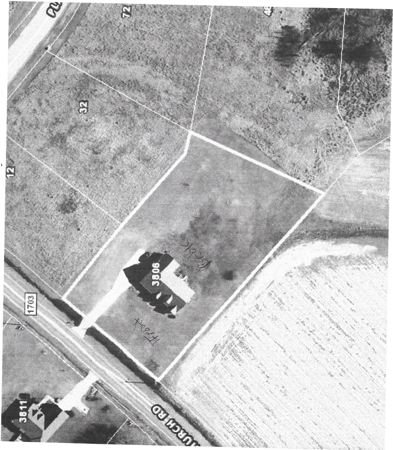
3806 Reed Hill Church RD