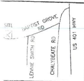
VICINITY MAP (NTS)

NOTES: AREA BY COORDINATES NO HORIZONTAL CONTROL FOUND WITHIN 2000' THIS SURVEY DID NOT HAVE THE BENEFIT OF A TITLE REPORT AND IS SUBJECT TO MATTERS THAT MAY DISCLOSE PROPERTY SUBJECT TO BOTH ABOVE AND OR BELOW GROUND UTILITIES AND OR EASEMENTS THIS LOT IS NOT LOCATED IN A FLOOD HAZARD AREA PER F.E.M.A. MAP #3720064200J; EFF DATE 02/03/2006 ZONE X