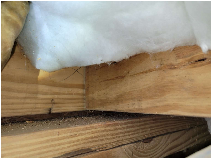
Picture 4 – Floor joists and rim band out of contact with knee wall top plates