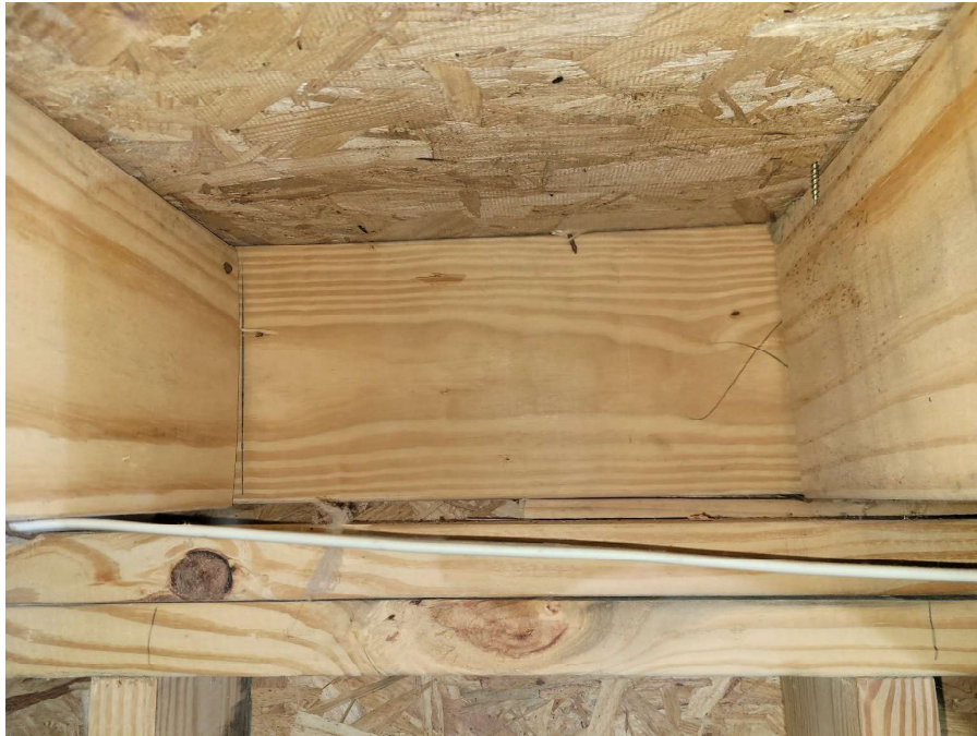
Picture 5 – Floor joists and rim band out of contact with knee wall top plates