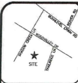
VICINITY MAP (NTS)