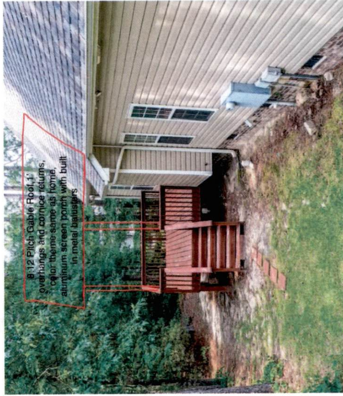
8:12 Pitch Gable Roof, 1' overhangs and cornice returns, color theme same as home, aluminum screen porch with built in metal balusters