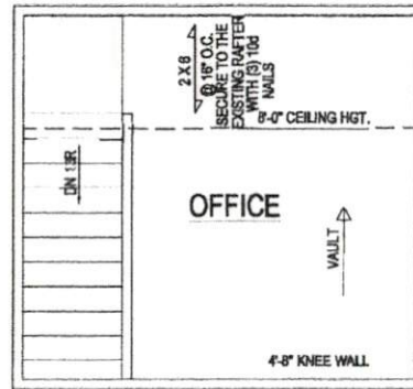
MAIN HOUSE SECOND FLOOR PLAN 2ND FLOOR HEADER & 2ND FLOOR CLG. CEILING HGT. = 8'-0" SCALE: 1/4" = 1'-0"