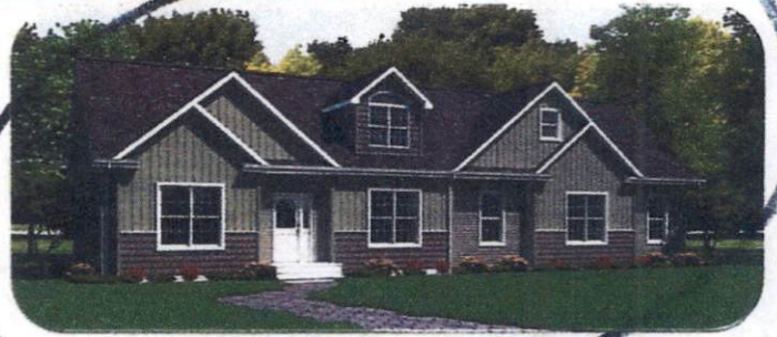
MULTIPLE OPTIONAL BUMPOUTS