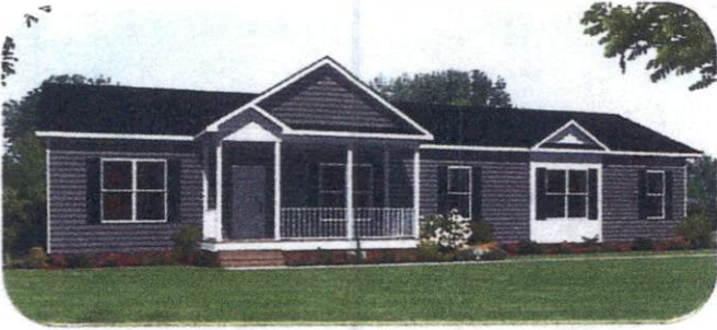
10' BUMPOUT SHOWN ON LOT MODEL

RENDERING WITH OPTIONAL BONUS AREA WITH 9/12 OR 12/12 ROOF PITCH