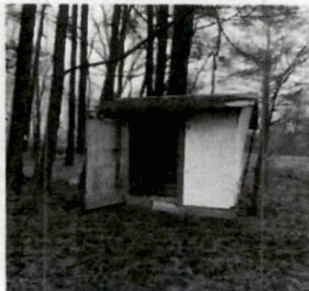
Wellhouse - No ACM