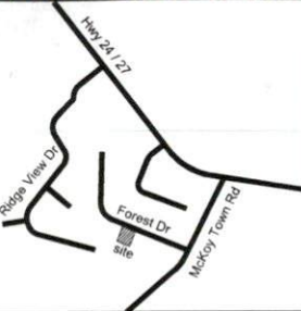
VICINITY MAP not to scale