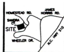
VICINITY MAP (not to scale)