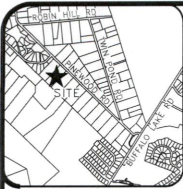
VICINITY MAP (NTS)