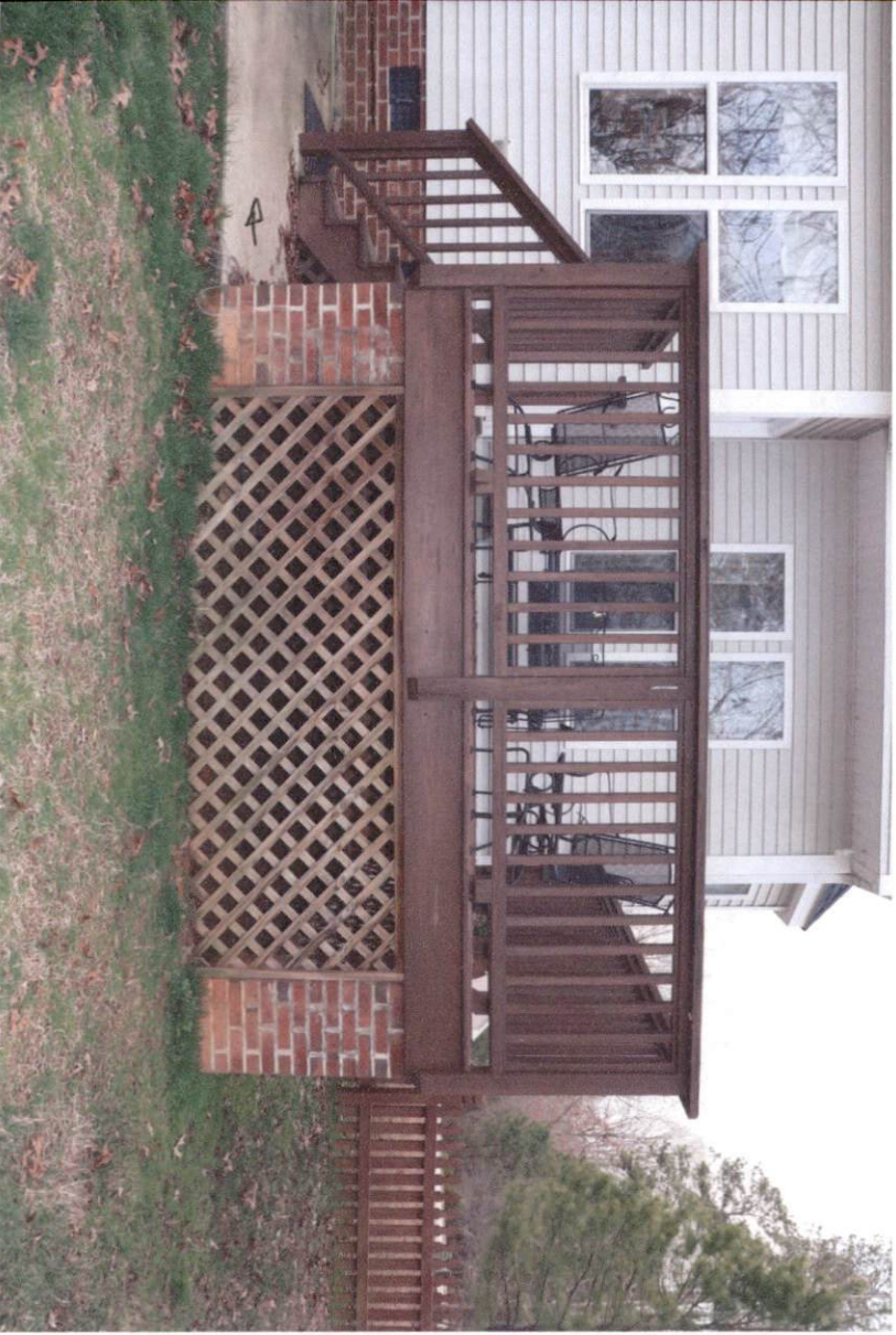
EXISTING DECK TO BE EXTENDED