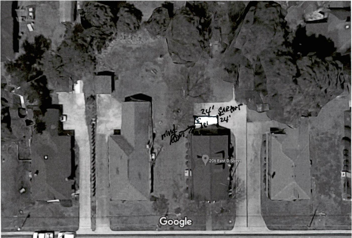
Imagery ©2018 Google, Map data ©2018 Google 20 ft