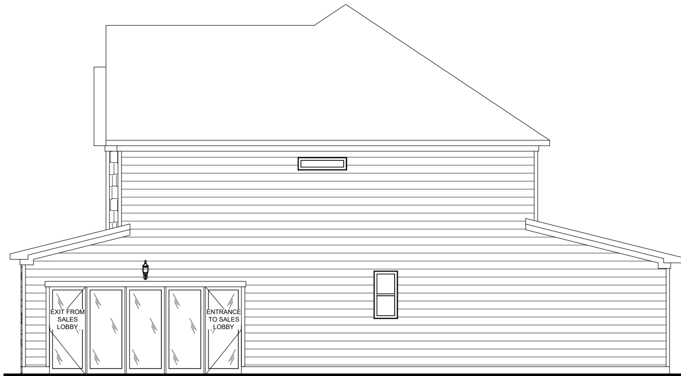
SALES CENTER RIGHT ELEVATION - 'D'

SCALE: 1/8"=1'-0" (11"X17" SHEET SIZE) SCALE: 1/4"=1'-0" (22"X34" SHEET SIZE)