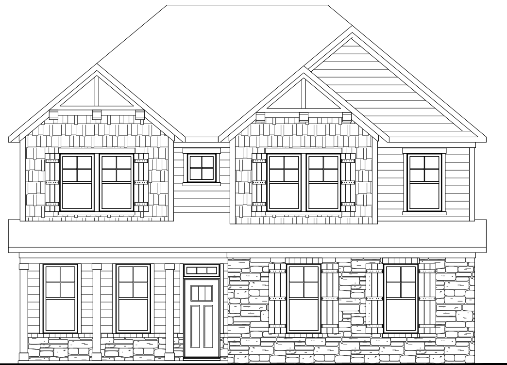
SALES CENTER FRONT ELEVATION - 'D'

SCALE: 1/8"=1'-0" (11"X17" SHEET SIZE) SCALE: 1/4"=1'-0" (22"X34" SHEET SIZE)