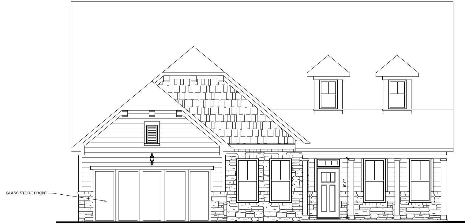
FRONT ELEVATION - 'B'

SCALE: 1/8"=1'-0" (11"X17" SHEET SIZE) SCALE: 1/4"=1'-0" (22"X34" SHEET SIZE)