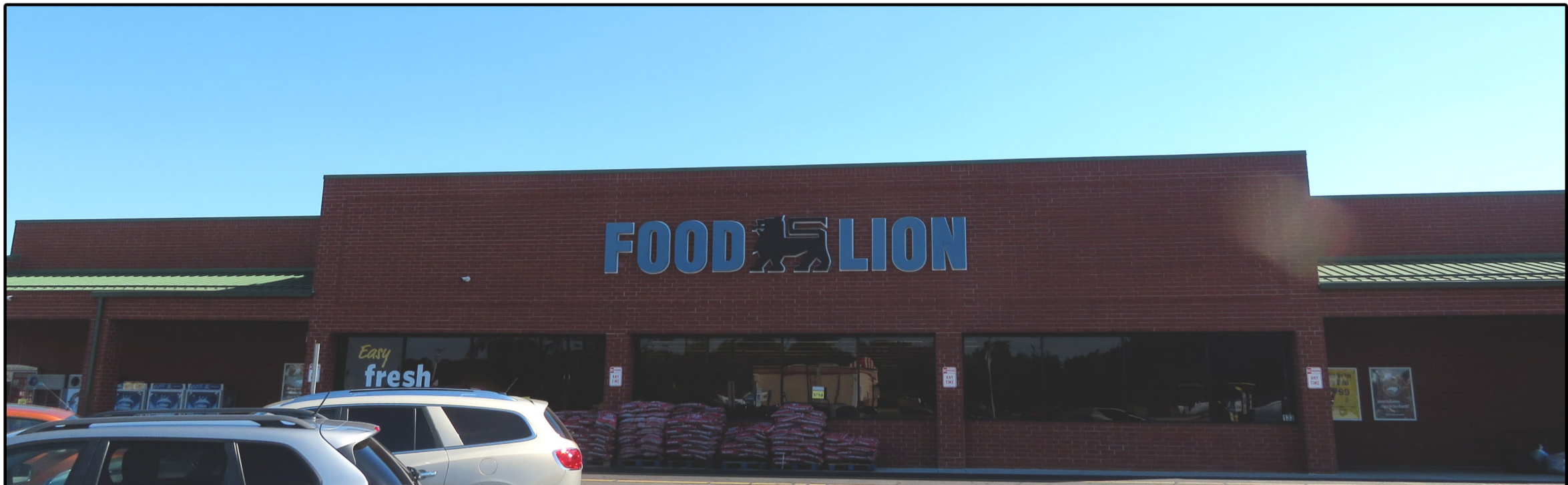
PHOTO OF EXISTING STOREFONT