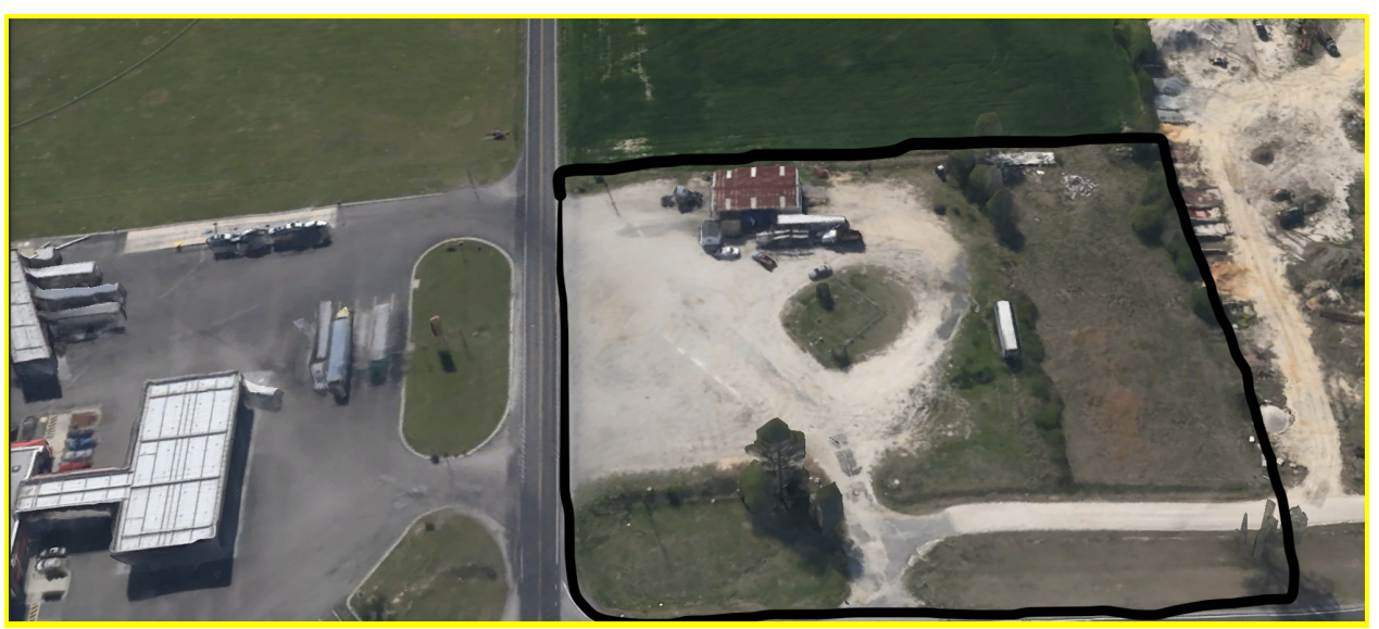
Property outlined in black