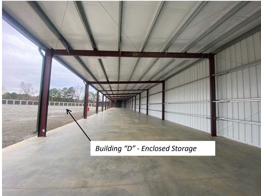
Building "D" - Enclosed Storage