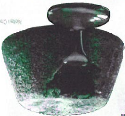
Molten Chocolate Cake