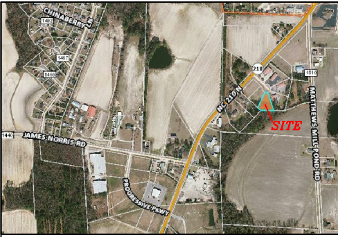
Vicinity Map (Not to Scale)